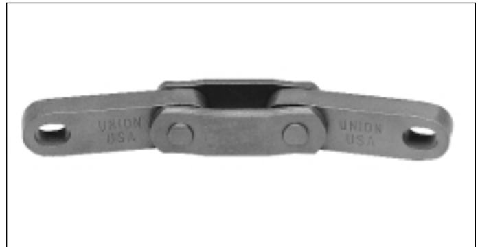
Table 1 — Double Flex Chain

The drawings shown are examples of just a few double flex chain styles. Many additional styles and configurations are available on a made-to-order basis. Sprockets are also available — split, solid, or bronze bushed.