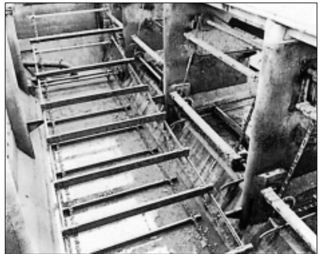
ACR810 Collector Tank Sprockets

All dimensions are in inches unless otherwise specified.