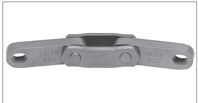
Table 1 — Double Flex Chain

The drawings shown are examples of just a few double flex chain styles. Many additional styles and configurations are available on a made-to-order basis. Sprockets are also available — split, solid, or bronze bushed.