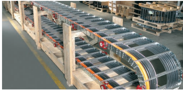
■ Ready-to-connect assembled steel cable carrier system, packed ready for installation

We develop, design and supply all components required for your individual cable & hose carrier system.