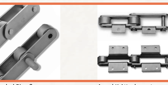
Extended Pins & High Sidebars Roller Conveyors