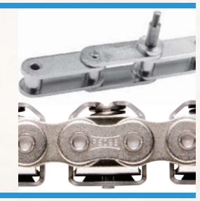
Vacuum Wrapper & Gripper