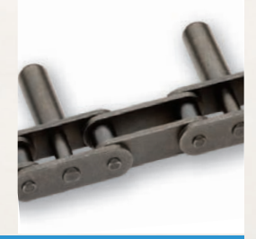
Pin Oven Titan™ Free-Flow Made-to-Order