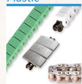
Industrial Plastic Poly Steel