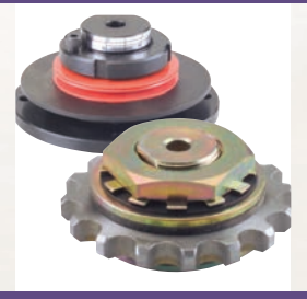
Torque Shield & Torque Limiter