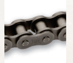
Large & Small Pitch