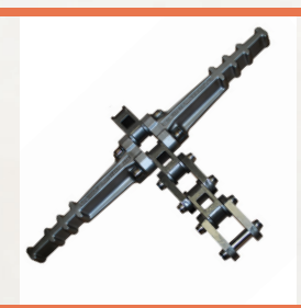
Forged Continuous & Straight Pull Miner