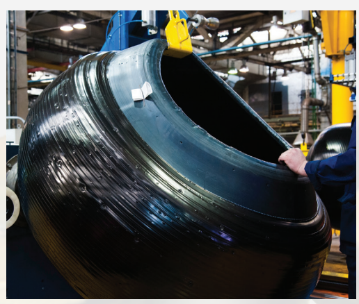
Rubber Tire Festooner