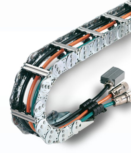
Steel Cable Carriers