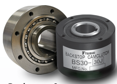
Backstops & Overrunning Clutches