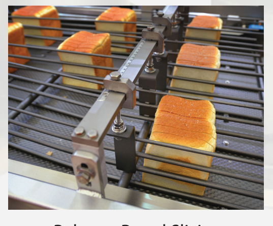
Bakery - Bread Slicing