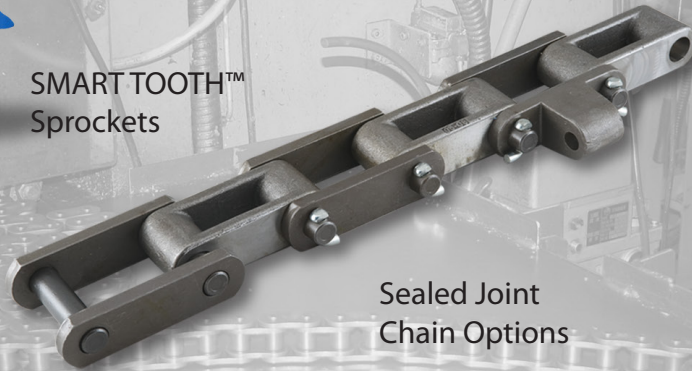
Sealed Joint Chain Options