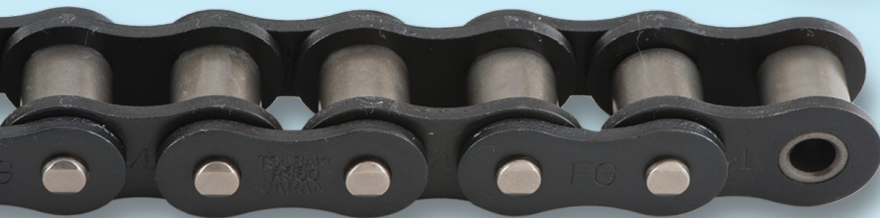
Lube-Free Lambda® Chain