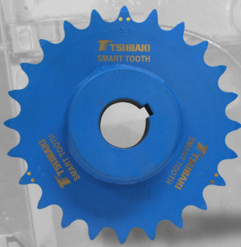
SMART TOOTH™ Sprockets